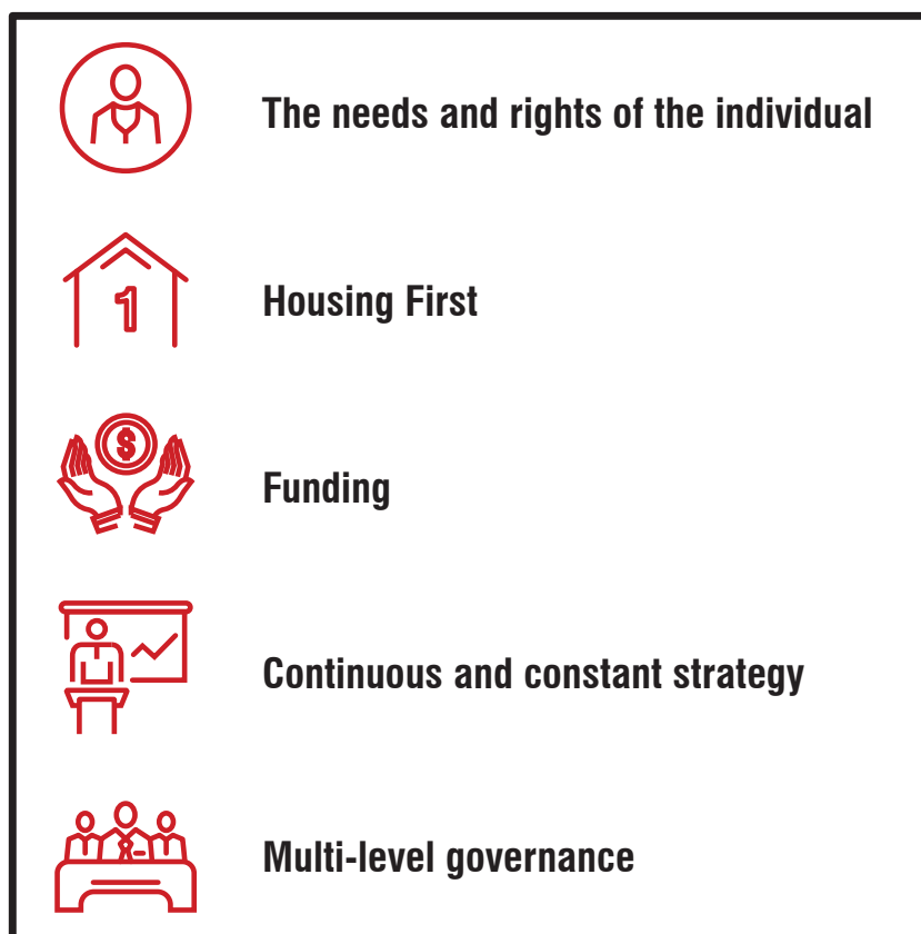
Figure 2: Five factors in developing integrated homeless solutions, identified by EU researchers