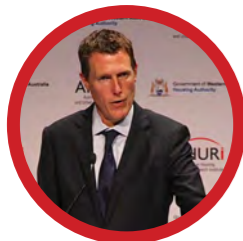
Hon. Christian Porter MP Federal Minister for Social Services 28 Oct 2015, National Housing Conference, Perth

“Through its housing and urban research, AHURI makes a critical and active contribution to the housing and policy debate... and its standard is very well recognised.”