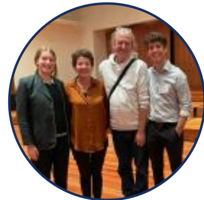
Education & Leadership