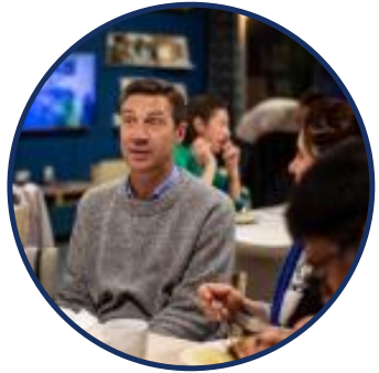
BBQs & Community Dinners