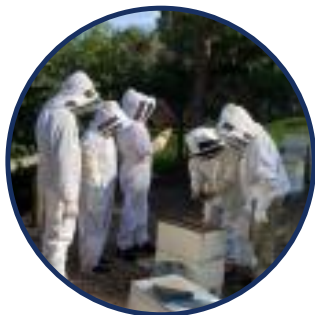
Activity & Entrepreneurship