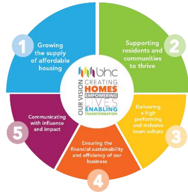
New BHC Strategic Plan developed