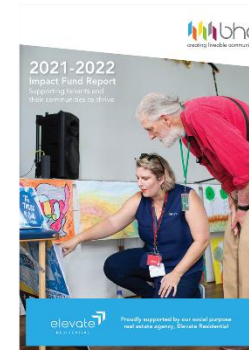
Measuring and communicating our impact