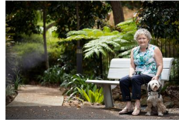
BHC Impact Fund established