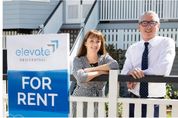
Elevate Residential launches