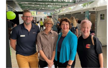
Broadening our Impact measurement and reporting framework