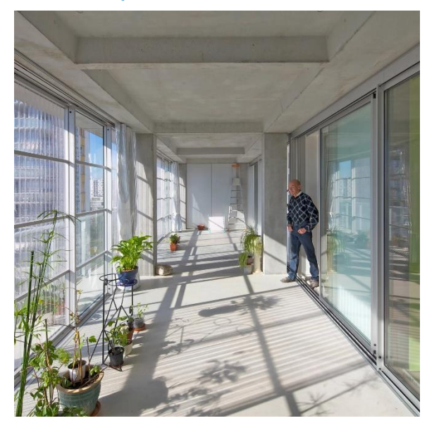
Adaptive Reuse, Bordeaux, France Architect: Lacaton Vassal

when an unplanned need arises.<sup>172</sup>