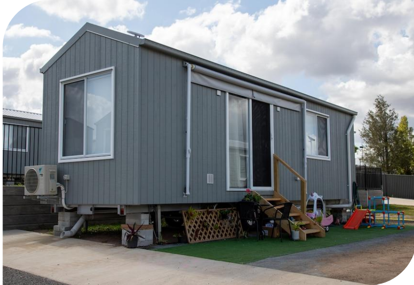
Tiny home in the Gympie Rapid Accommodation Park