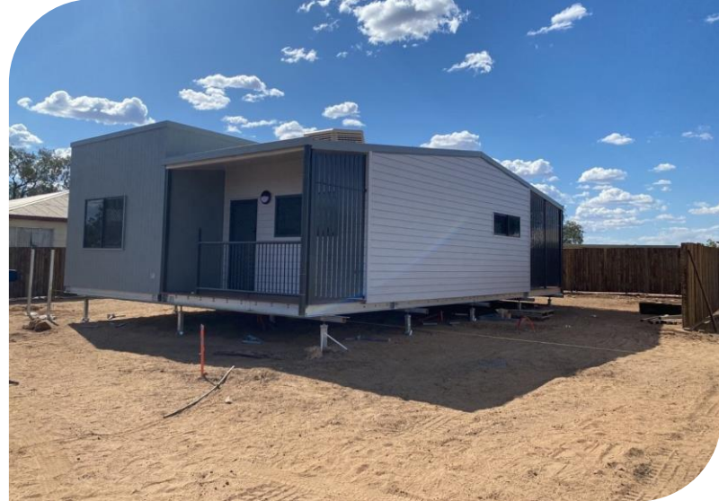
Five modular homes delivered to Roma and Cunnamulla last week, contracted through Hutchinson Builders

More than 100 prefabricated homes to be delivered by the end of 2023, including 53 social homes and more government-employee homes