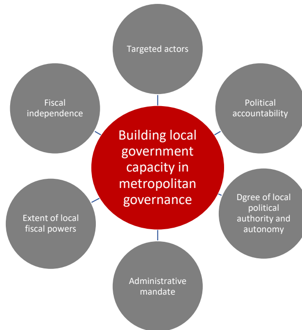
Figure 1: Revalorising the role of local government in metropolitan governance

Source: Adapted from Andersson, Bauer et. al. 2008:3-4.