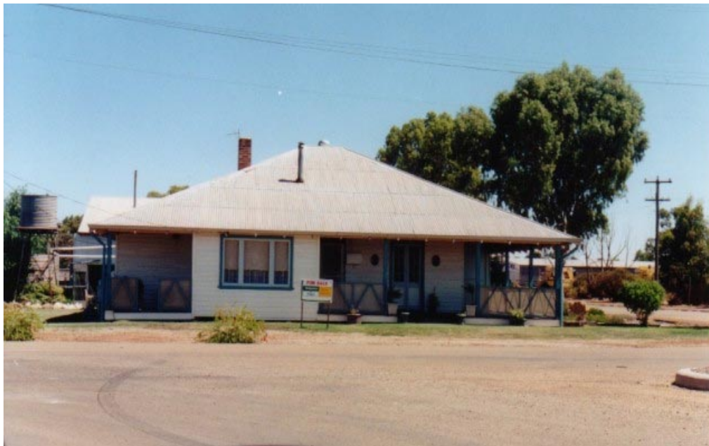
Figure 3: House for Sale in Corrigin - $18,500

At the time of the study, house prices ranged from $18,500 to $125,000 in Corrigin, reflected the wide range in quality as well as the relatively small contribution the land itself makes to the asking price (see Figure 3).