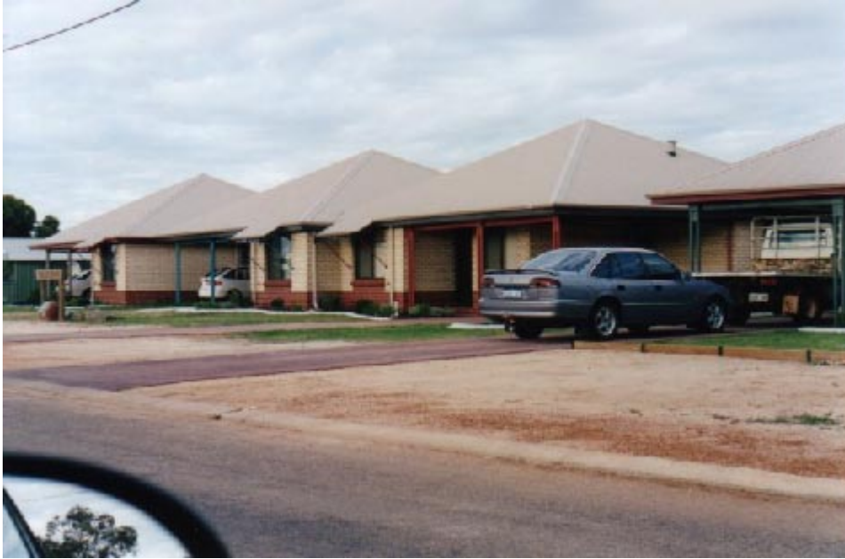
Figure 4: "Mallee Villas" young singles accommodation, Hyden