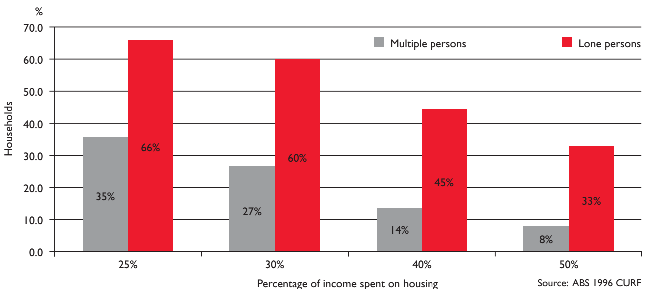
RENTAL AFFORDABILITY FOR YOUNG PERSONS LIVING INDEPENDENTLY BY HOUSEHOLD TYPE, 1996

Those respondents who were unsure whether they were receiving CRA, or who said they were not, have been excluded from these calculations